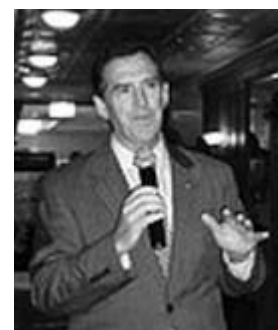
Sen. DeMint shares some analysis of the election going forward after the convention.