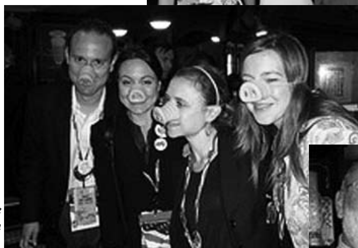
Attendees get into the spirit of the reception with complimentary pig snouts.