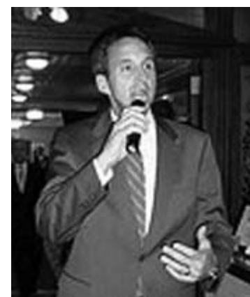
Governor Pawlenty (R) discusses the presidential election.